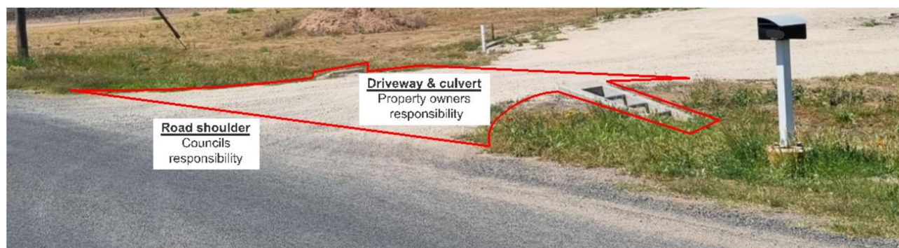
FIGURE 3: RESPONSIBILITIES- ACCESS TO PRIVATE PROPERTY (CULVERT CROSSING)

A road authority does not have a statutory duty or a common law duty to perform road management functions in respect of a public highway which is not a public road or to maintain, inspect or repair the roadside of any public highway (whether or not a public road).