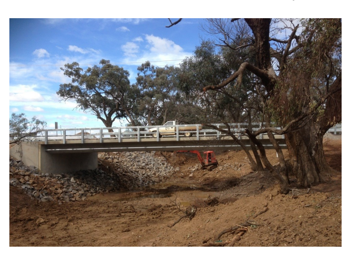
The bridge has been rebuilt using disaster grant funding

Some of these people are, in mid-2014, only now