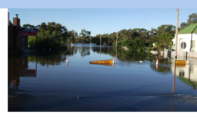
The streets of Donald go underwater

Buloke Shire staff were coordinating the shire's response and provided support to the community even as their own homes and property were being inundated.